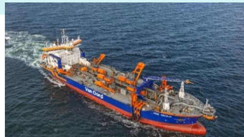
Van Oord Dredger, Vox Amalia