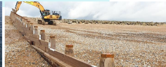
Groynes being constructed at nearby Hythe Ranges